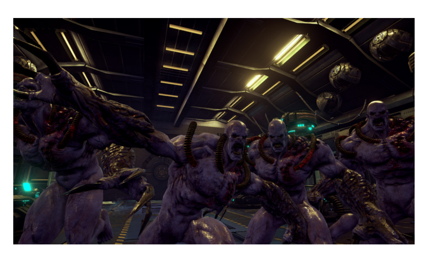
Borderlands 2: Mechromancer Madness Pack Free Download [pack]